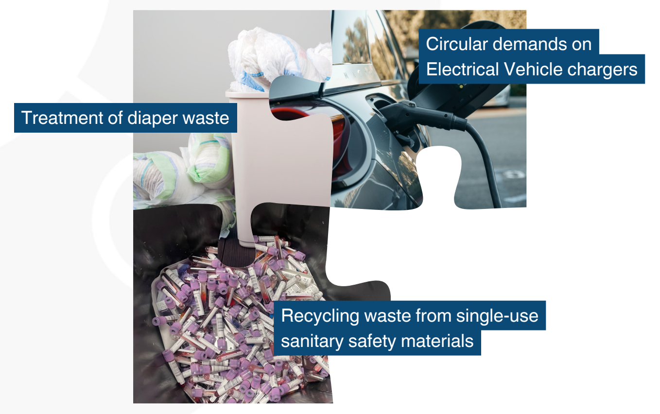
Figure 1 - The three procurement cases supported by the BRINC project

The InnoBroker model presented in this report builds on experience and learnings from the activities in the BRINC project and from the supported procurement cases. The BRINC project has supported three main procurement cases, described more in detail in the next pages.