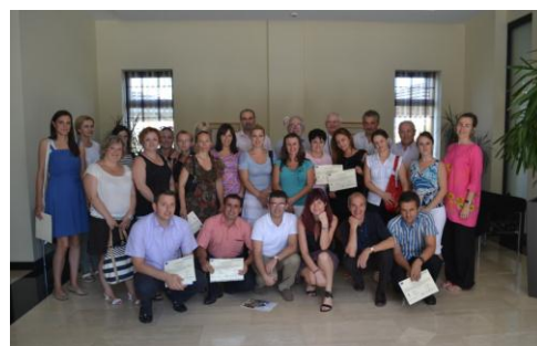
Training in Montenegro