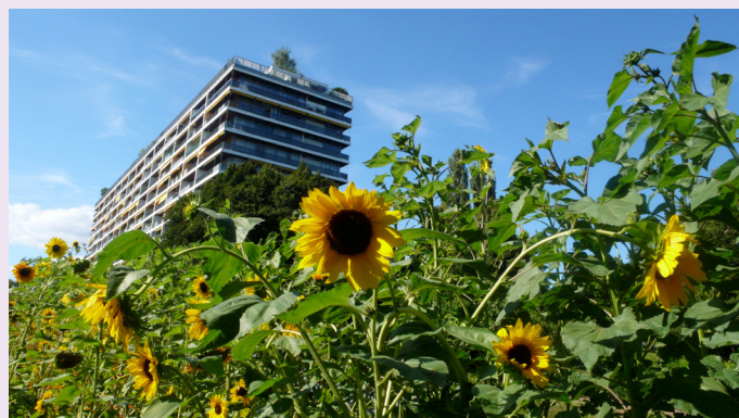
The Budé farm in Geneva: an example of urban agriculture.